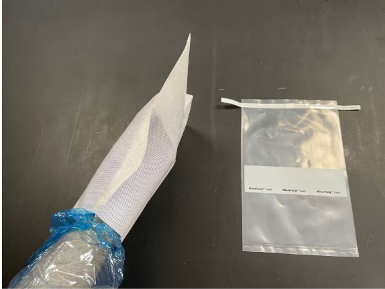
Figure 3. MT-Mitt – hand inserted (side view)